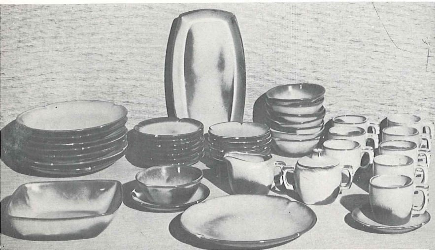
5LS-45 PC. SERVICE SET, BOXED-$46.00

AVAILABLE ONLY IN: Woodland Moss, Desert Gold, Brown Satin and Prairie Green.