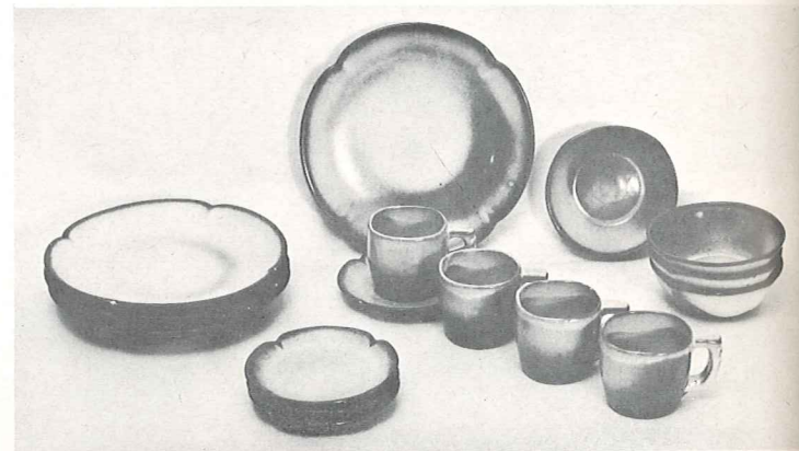
5SX-16 PC. STARTER SET, BOXED-$16.00